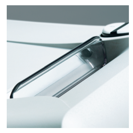
PATENTED SAFETY SHIELD

Multifunction control element uses optical signals to indicate operational status and functions as an emergency stop switch.