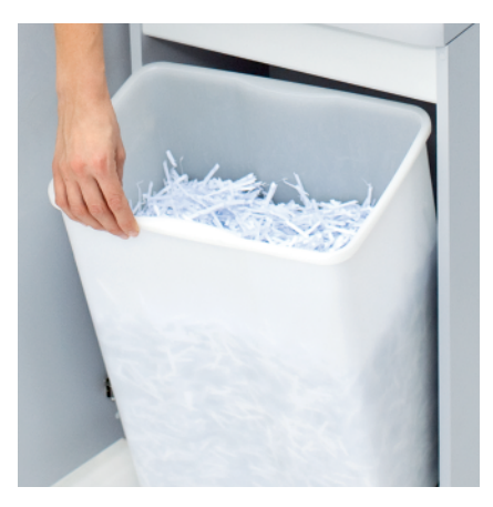
ENVIRONMENTALLY FRIENDLY BIN

Electronically controlled, transparent safety shield keeps fingers out of the feed opening.